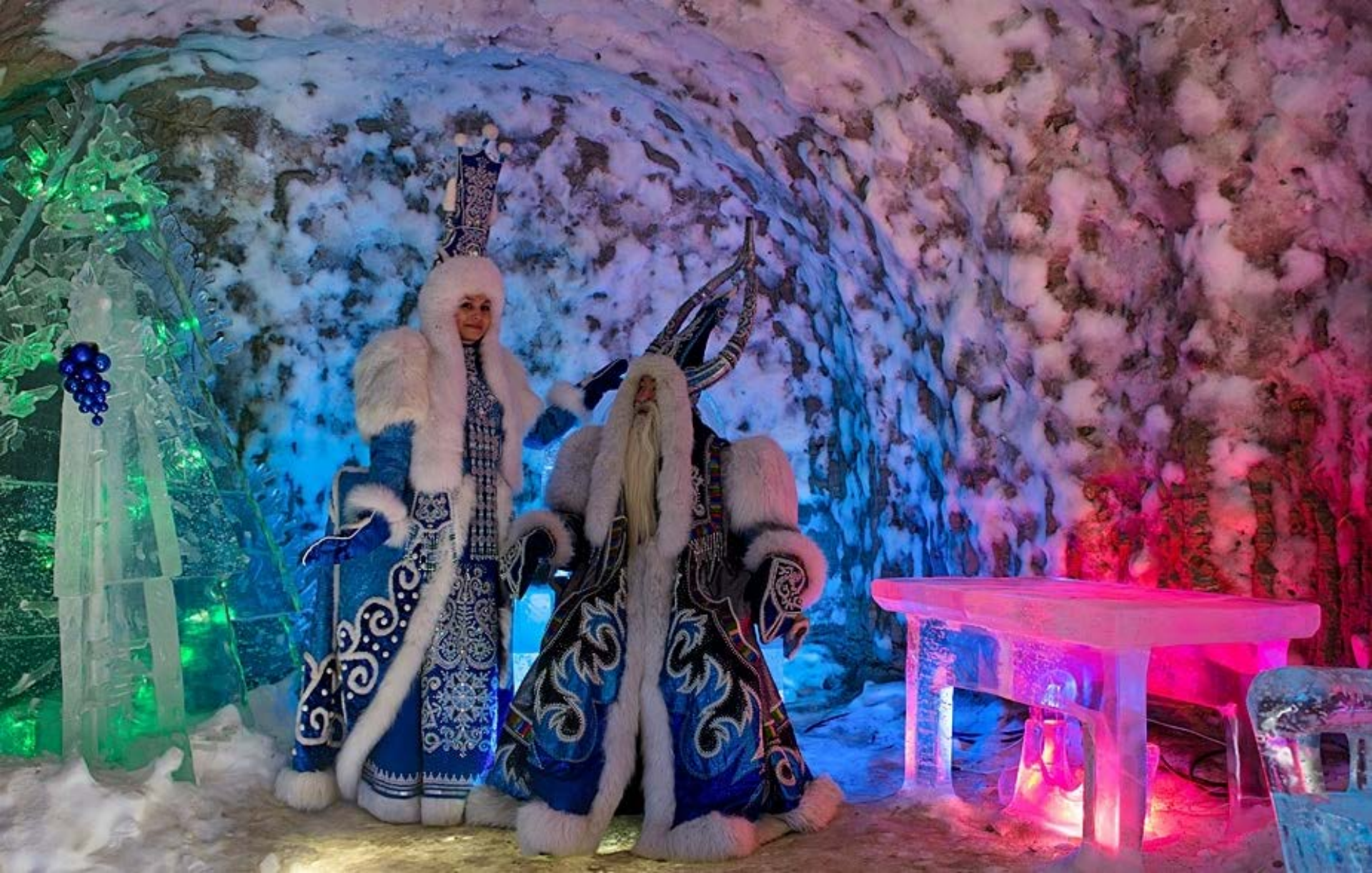
Ice tunnel complex "Permafrost Kingdom"