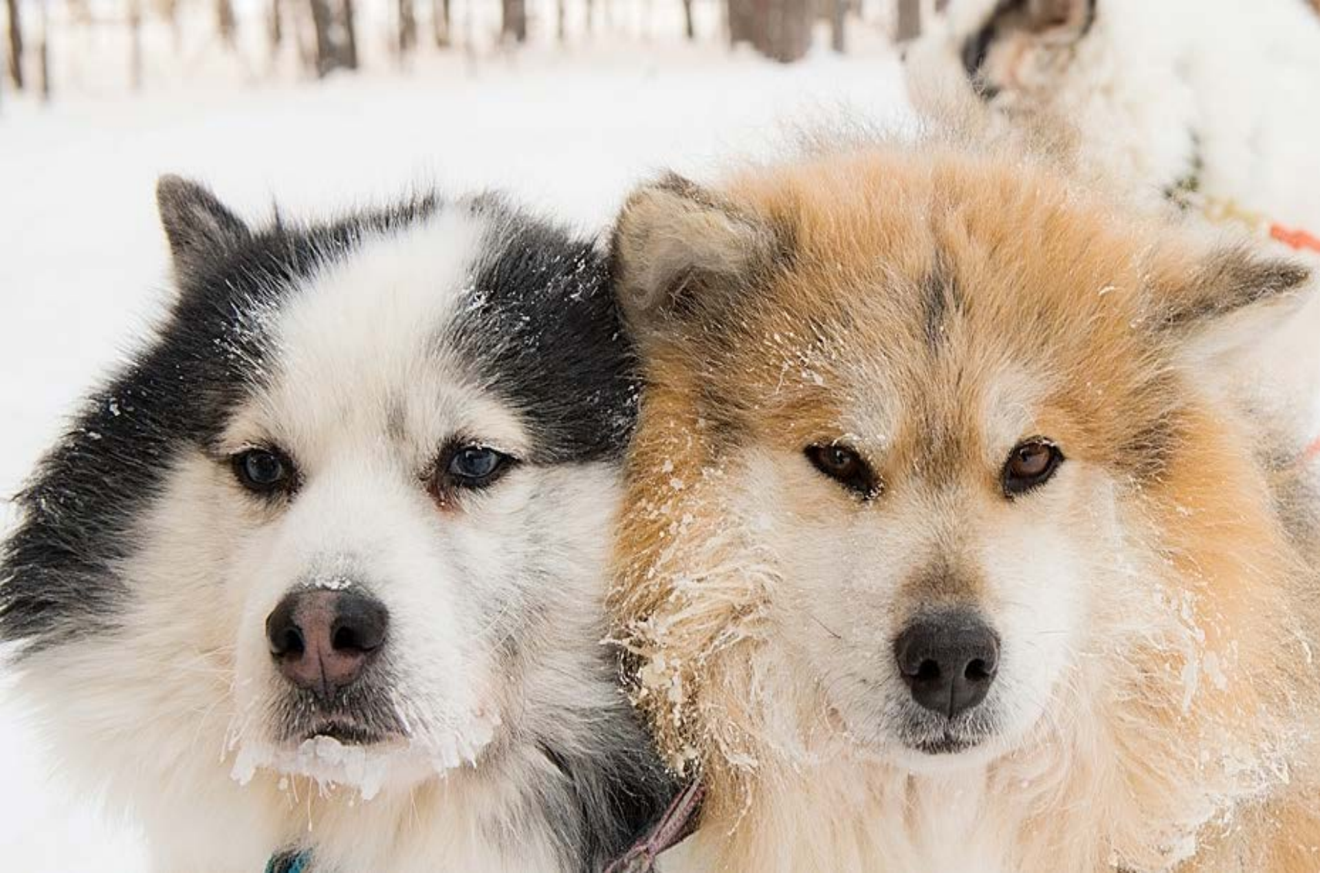
Yakut husky dogs