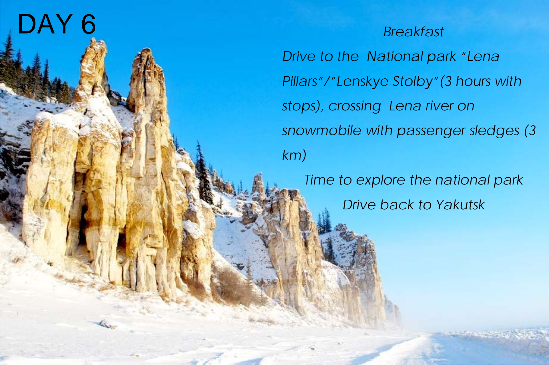
Lena Pillars National park