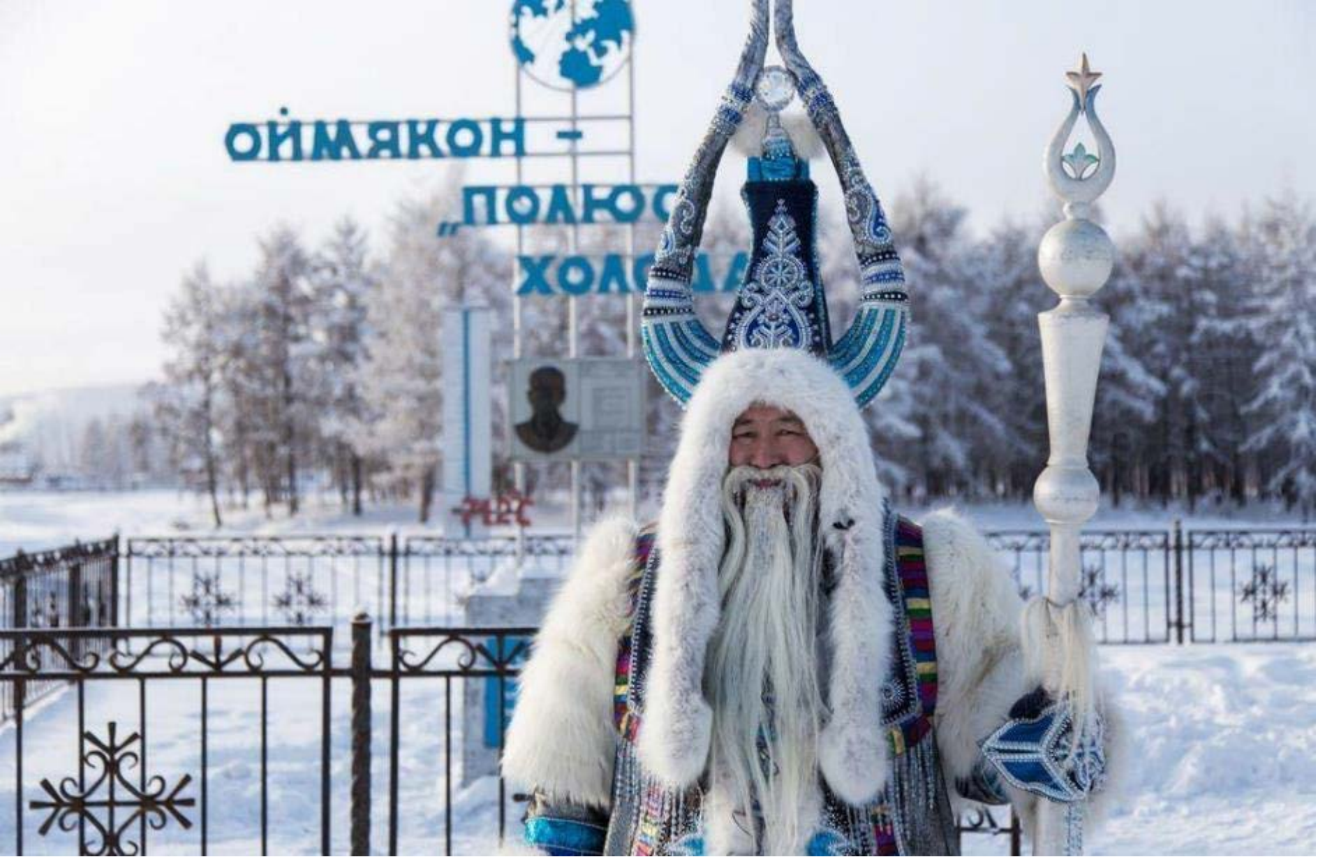
Keeper of the Cold Chushaan