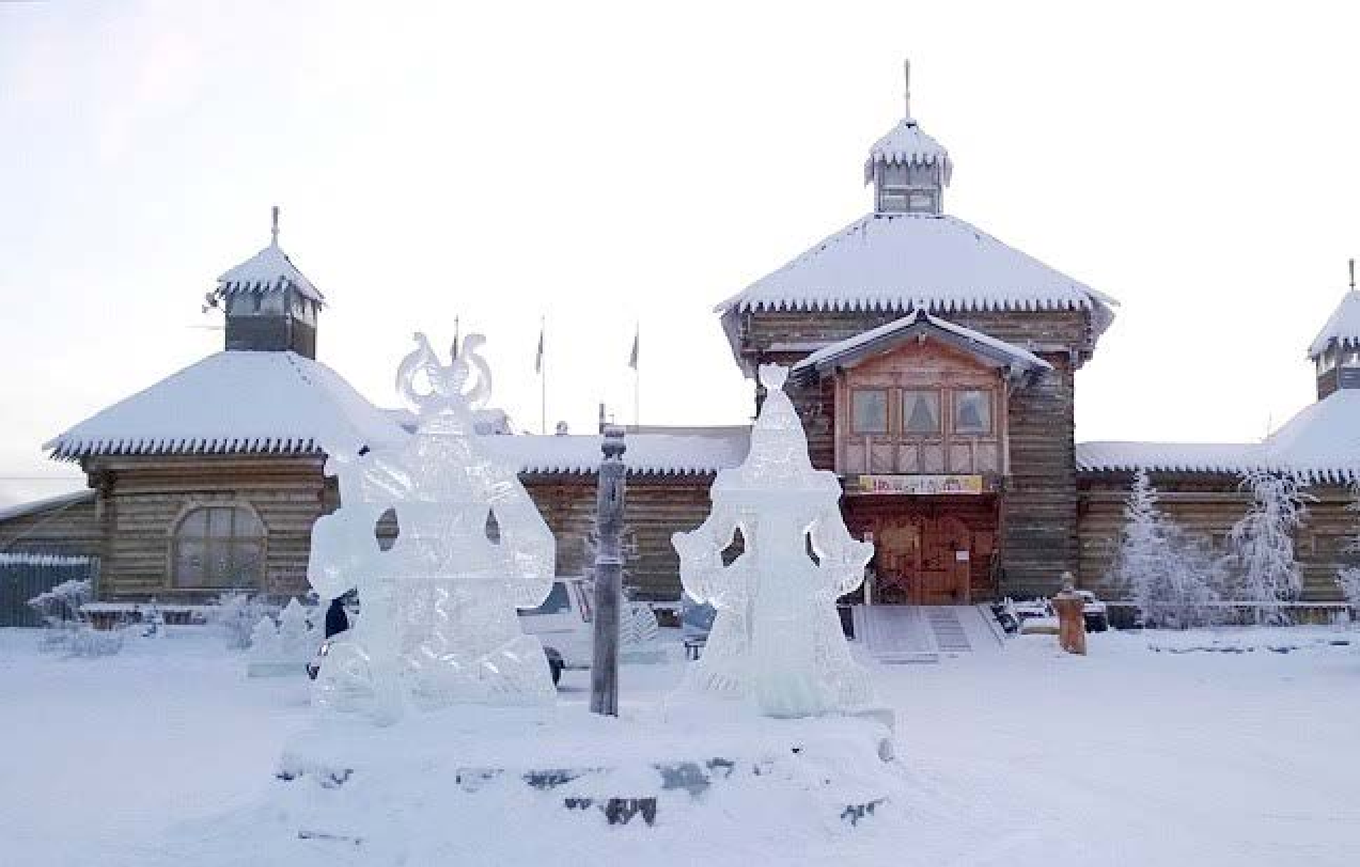
Cultural center “Chochur Muran”