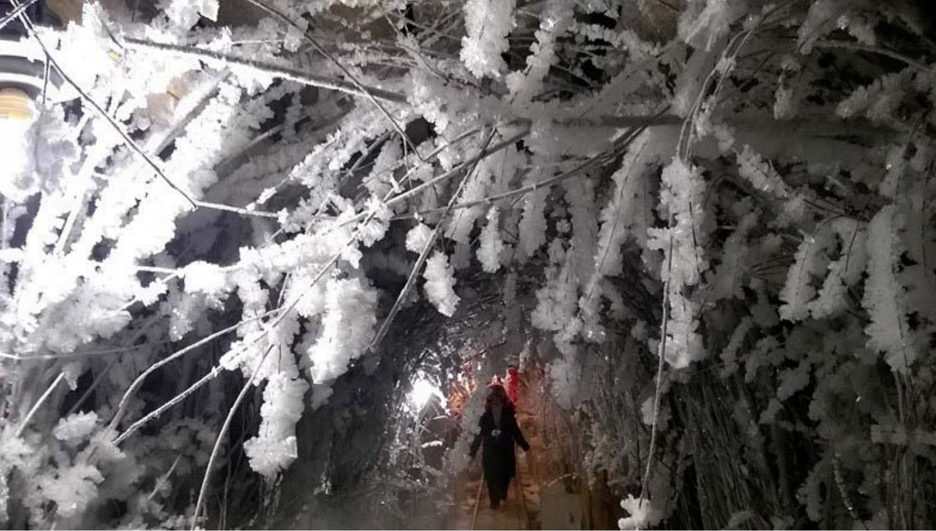
Ice tunnels “Chyshaan residency”