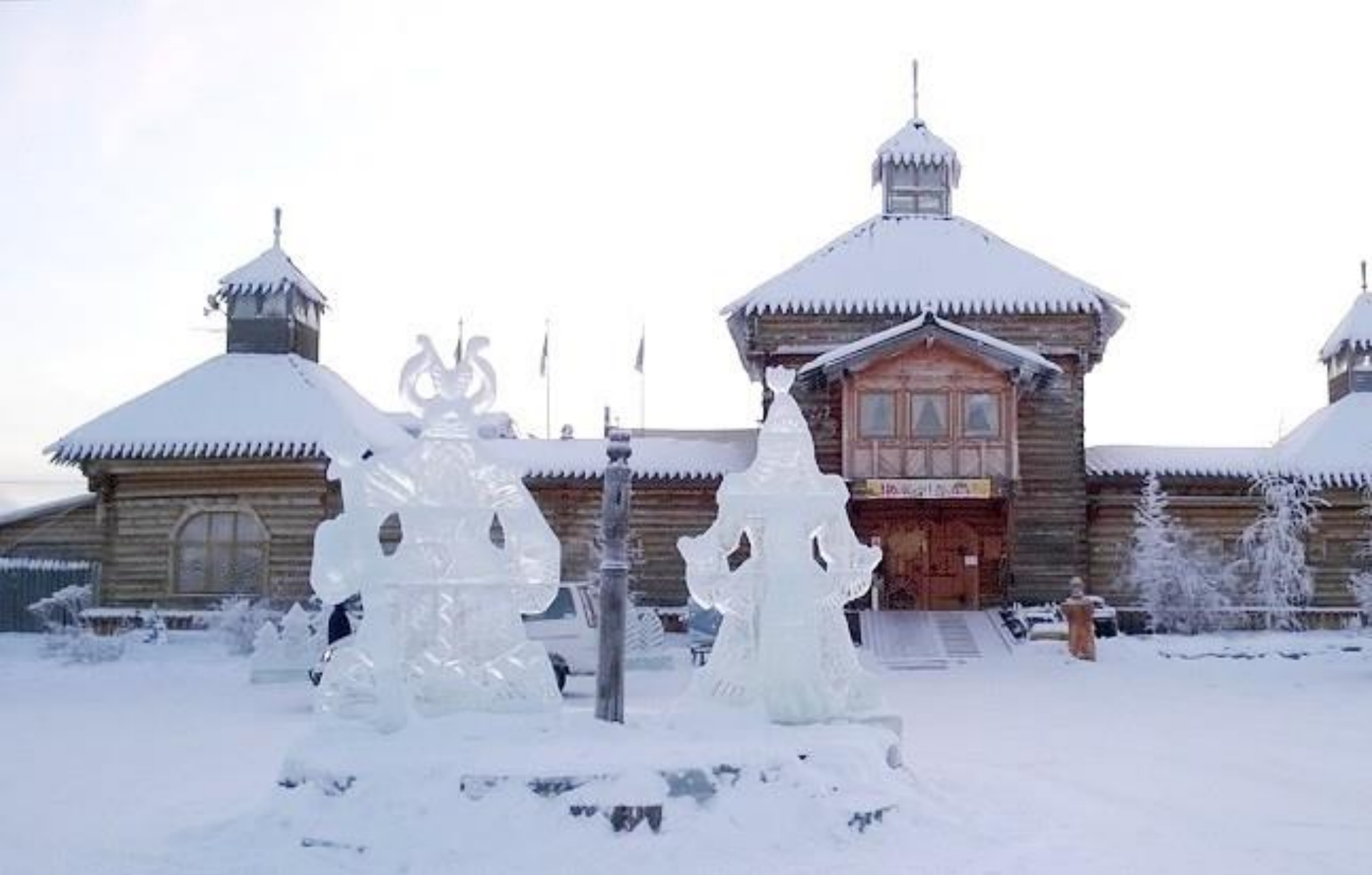
Cultural center "Chochur Muran"