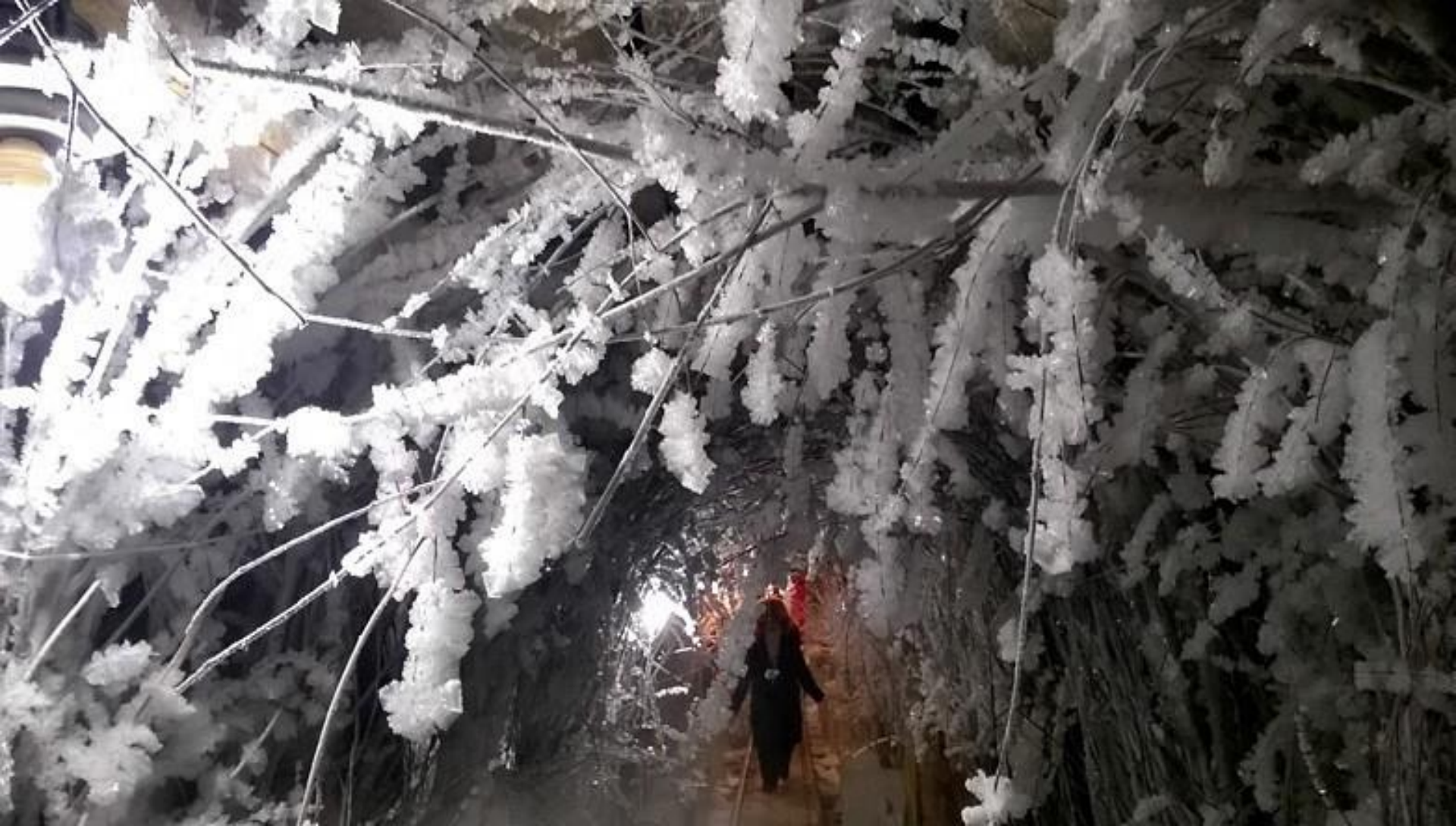
Ice tunnels “Chyshaan residency”