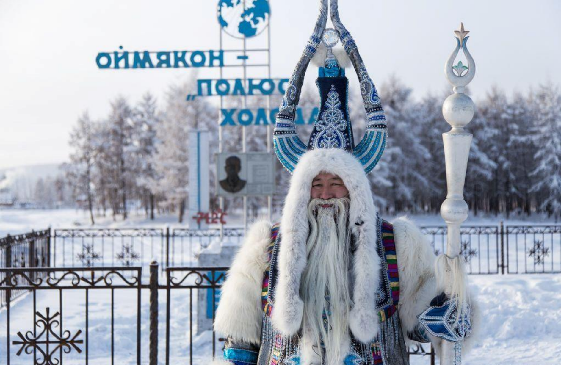
Keeper of the Cold Chushaan