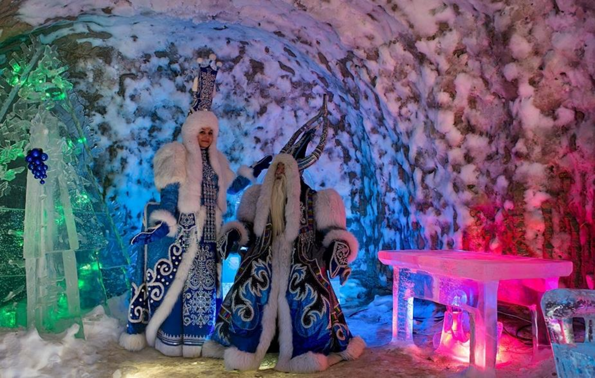
Ice tunnel complex "Permafrost Kingdom"