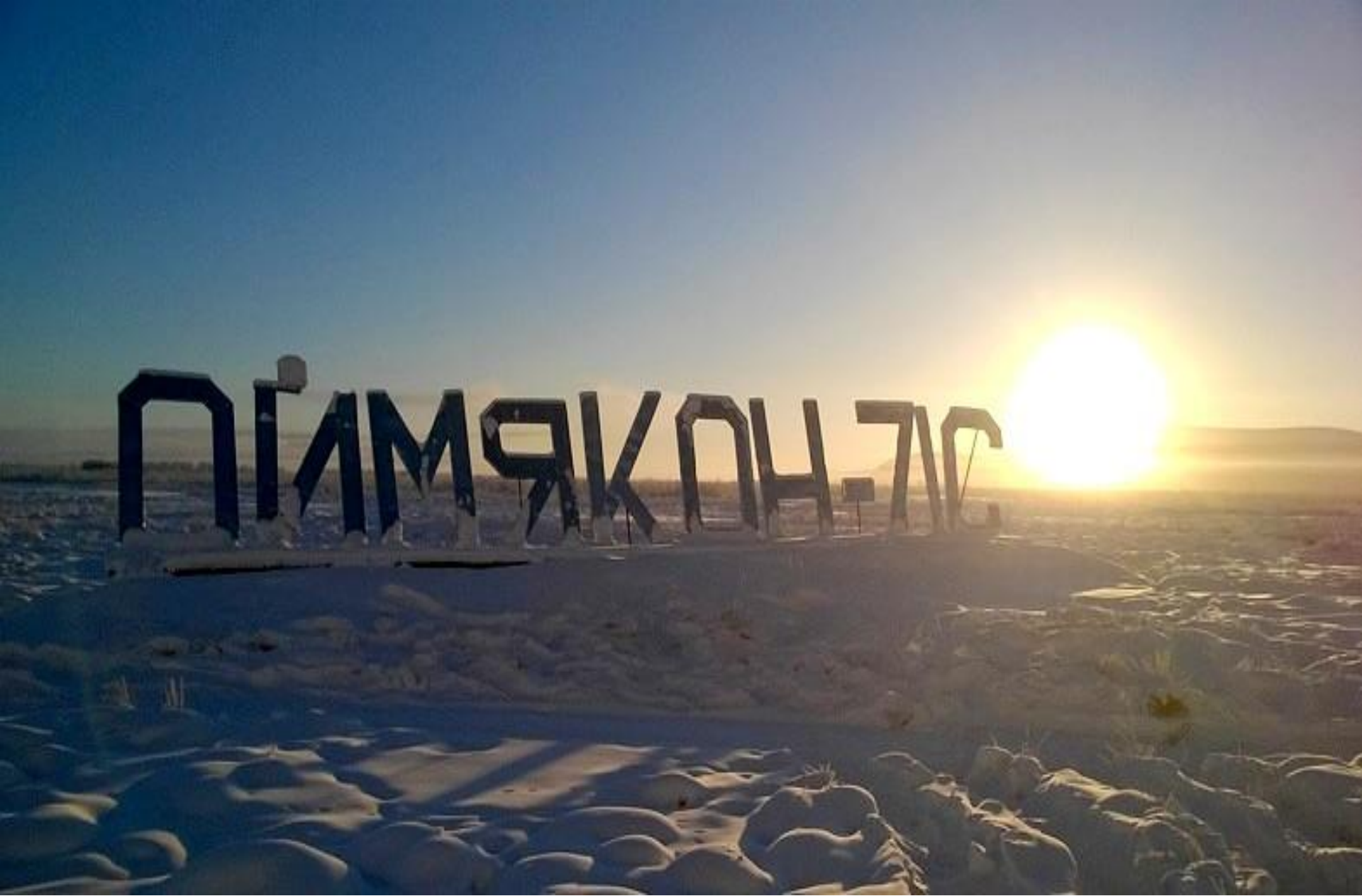
Poymyakon -71 C entry mark